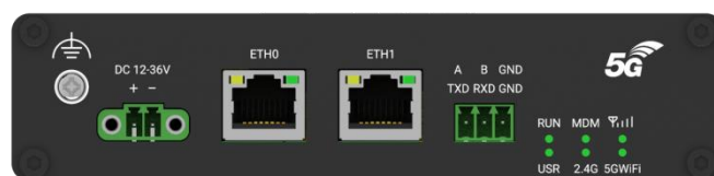
R5020L-A-5G-A25GL (PN: B098004)