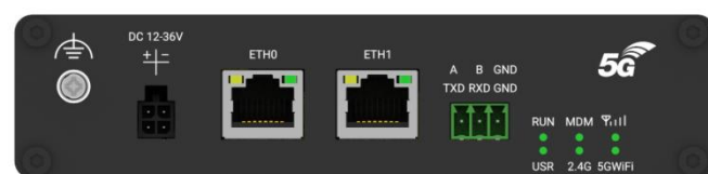
R5020L-B-5G-A30EU (PN: B098005)