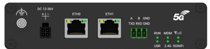
R5020L-B-5G-A30EU (PN: B098005)