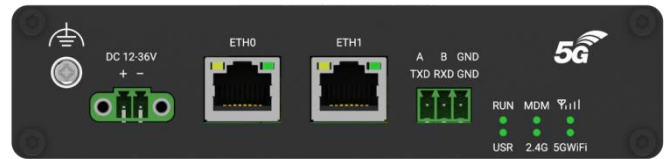
R5020L-A-5G-A25GL (PN: B098004)